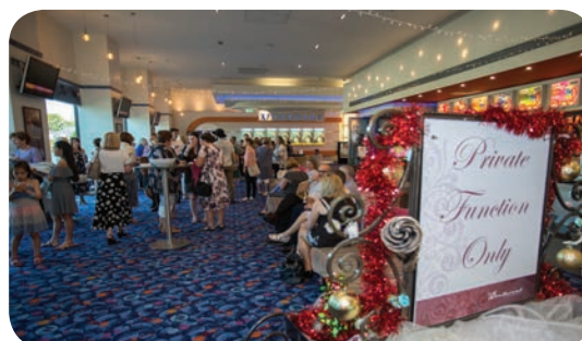
Thank you to our Sponsors: Refined Real Estate Holiday Wonders & Wallis Cinemas Mitcham