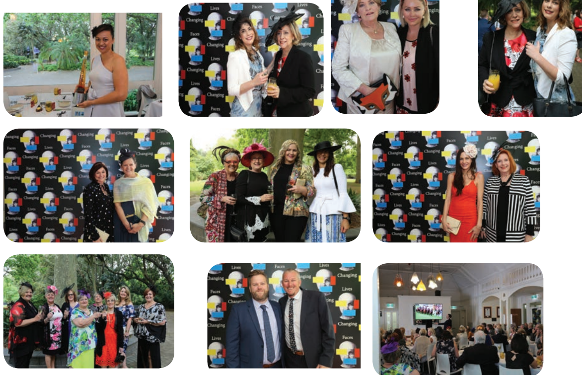
MELBOURNE CUP 2017