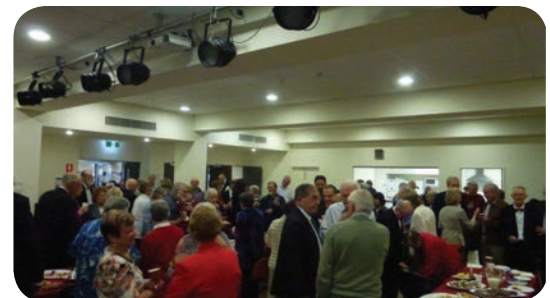
Afternoon tea provided an ideal opportunity to meet & greet the performers