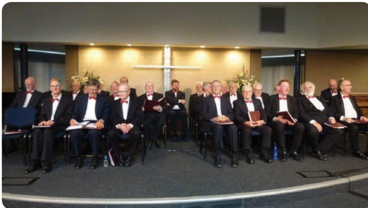
Adelaide Male Voice Choir

We look forward to seeing you for morning tea in December.