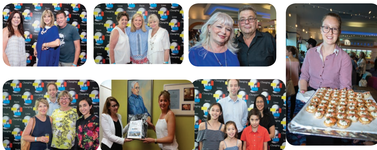
ADVANCED MOVIE SCREENING "WONDER"