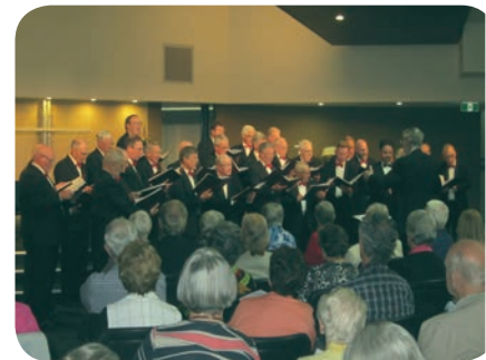
The Adelaide Male Voice Choir performing for the benefit concert