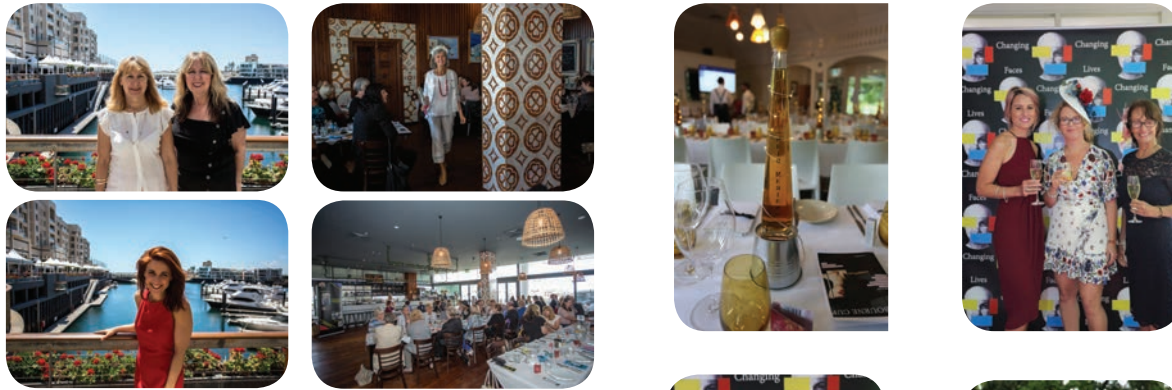
LUNCH @ ELLENIKA